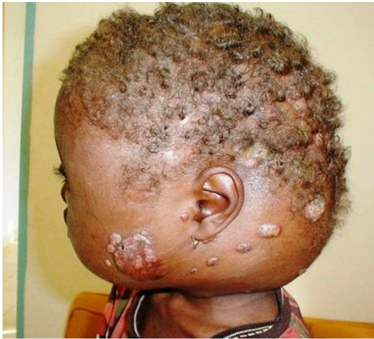
Fig 1: Swelling of the occipitotemporal, malar and left cheek areas