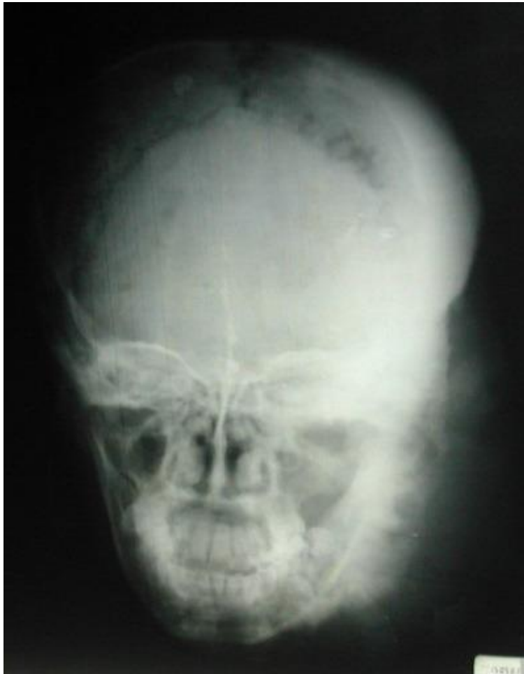
Fig 2: X-ray showing osteosclerosis and osteolysis of the left side of the skull