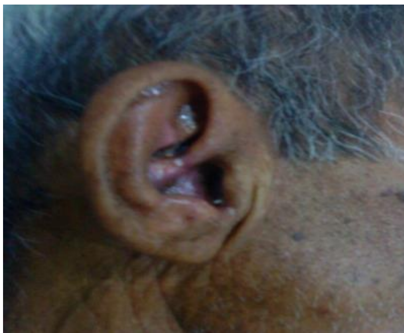
Fig 2: Shows vesicular rash on erythematous base over external ear