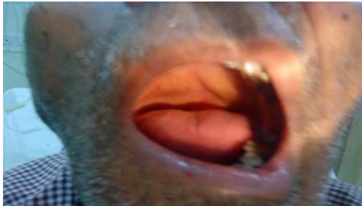
Fig 4: Shows soft palate movements on right side Absent