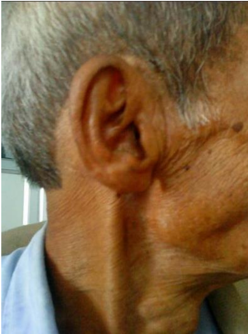
Fig 7: Shows complete recovery of vesicular rash on external ear